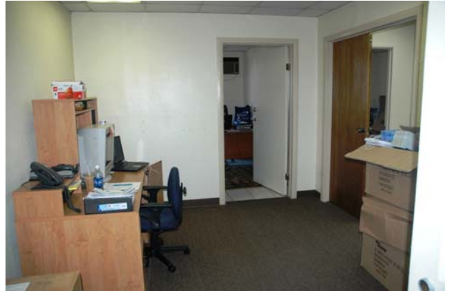
Moving into our new, four-room office space.

In August 2008 we rented office space in Lemon Grove, CA, which has become our headquarters. We have installed a network server, phone system, office equipment, and all necessary furniture and have been operating smoothly since September 2008. Having an office also allowed us to hire an Operations and Communications Coordinator, who oversees all outside communications and clerical work at the agency.