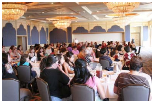
General session in the Mission Bay Ballroom.

Our annual conference was a wonderful event that received incredible ratings from those who attended. We held it at the beautiful Bahia Hotel and Resort on Mission Bay, in San Diego. The conference featured top-rate keynote speakers, informative and relevant workshop sessions, and a networking reception onboard the William D. Evans sternwheeler boat. We’re extremely grateful to all who participated in planning and implementation of the conference, and look forward to another wonderful event in 2010.