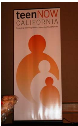
TeenNow California banner