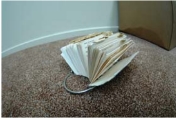
CACSAP's first membership "database" from 1971.

TeenNow California has come a long way from our origins. Founded almost 40 years ago by a group of dedicated volunteers, in the past year and a half we have established the infrastructure needed to grow and expand the organization to better serve our members and the general public.