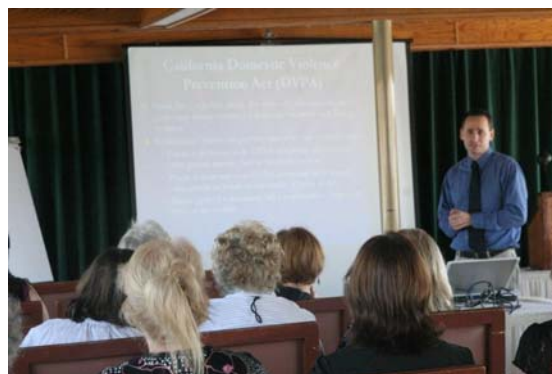
Dynamic, youth-presented workshop.

“It was the best conference in a long time! Location was nice and the food was great.”